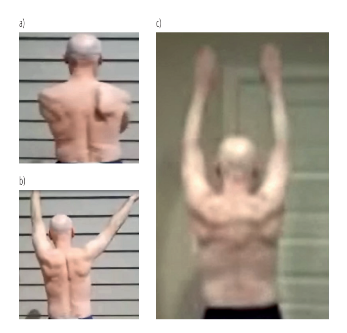
Figure 1. Pre- and post-surgical images of a 61-year-old male patient with scapular winging due to heavy lifting for an extended period as an airline pilot: a) scapular winging; b) muscle weakness, and limited shoulder movement in his right upper extremity; c) post-surgical recovered active range of motion (shoulder abduction and flexion) to 180° 10 months after decompression and neurolysis of the upper brachial plexus and the long thoracic nerve, and a partial resection of the scalene muscle procedures